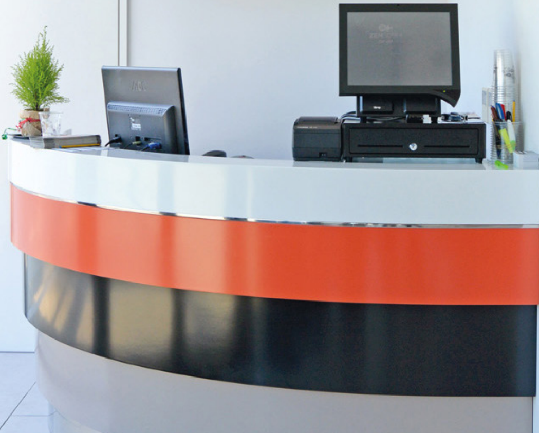
50" Professional Monitors